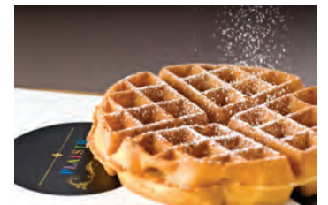
Traditional Belgian Waffles

Includes a choice of pastry: Butter Croissant, Chocolate Croissant, Raisin Croissant or Almond Croissant. Served with Fresh Fruit Salad Cup & Fresh Squeezed Orange Juice or Apple Juice.