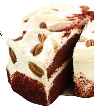
Plaisir Famous Red Velvet