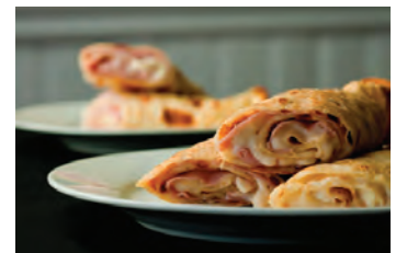
Ham, Egg & Cheese Crepe

Served with a side of House Salad or Potato Chips Add Ham or Turkey $1.00, Add Smoked Salmon $2.00