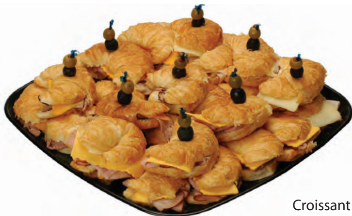
Croissant Sandwich Platter