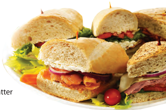
Baguette Sandwich Platter

Smoked salmon, non fat cream cheese, tomatoes, dill & lemon