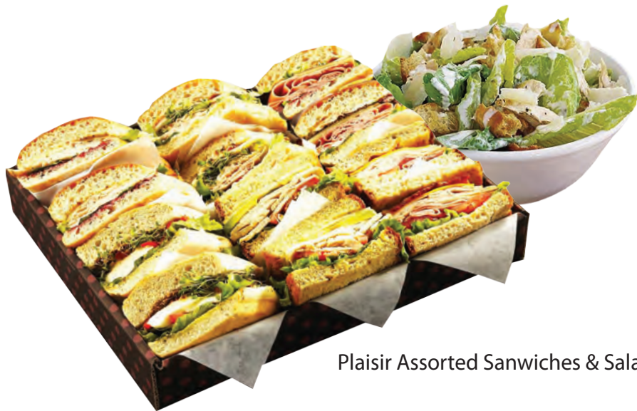
Plaisir Assorted Sanwiches & Salad

Assorted Sandwiches, 3 Salads, Chips, Assorted Pastries, Cream Puffs & Cupcakes