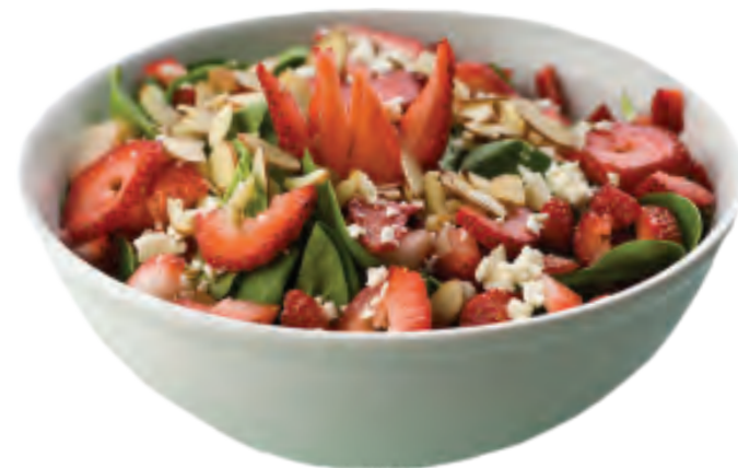
Fresh Spinach & Strawberry Salad

Fresh romaine lettuce, Albacore tuna, kalamata olives, avocado, green beans, baby carrots, cherry tomatoes, with honey dijon dressing